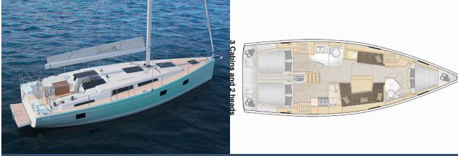
3 Cabins and 2 heads